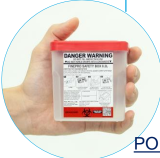
HANDY AND PORTABLE DESIGN