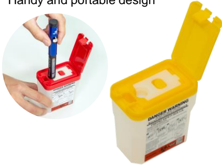
Size: W80xD50xH80 mm

Portable pen needle disposal box Hold up to 100pcs of pen-needle Handy and portable design