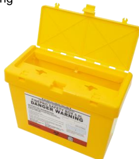
Size: W279xD136xH210 mm

Body lid integrated, easy assembly High penetration resistance Large opening