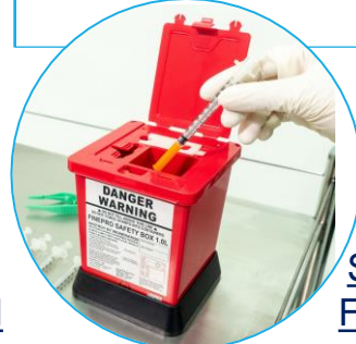
SUITABLE SIZE FOR HOME USE