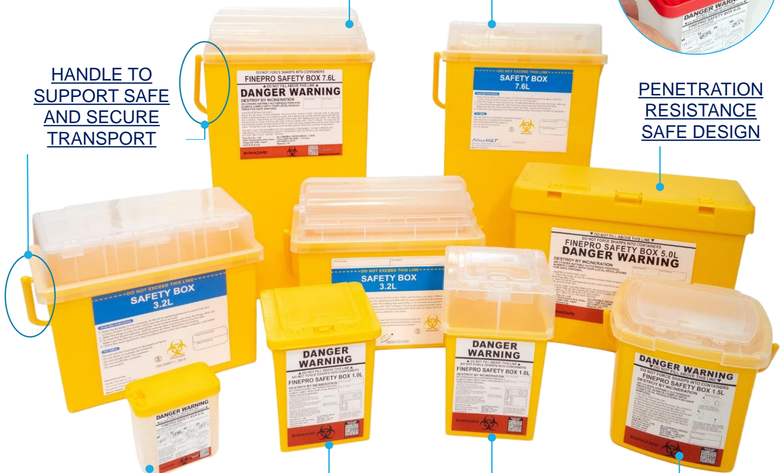
PENETRATION RESISTANCE SAFE DESIGN